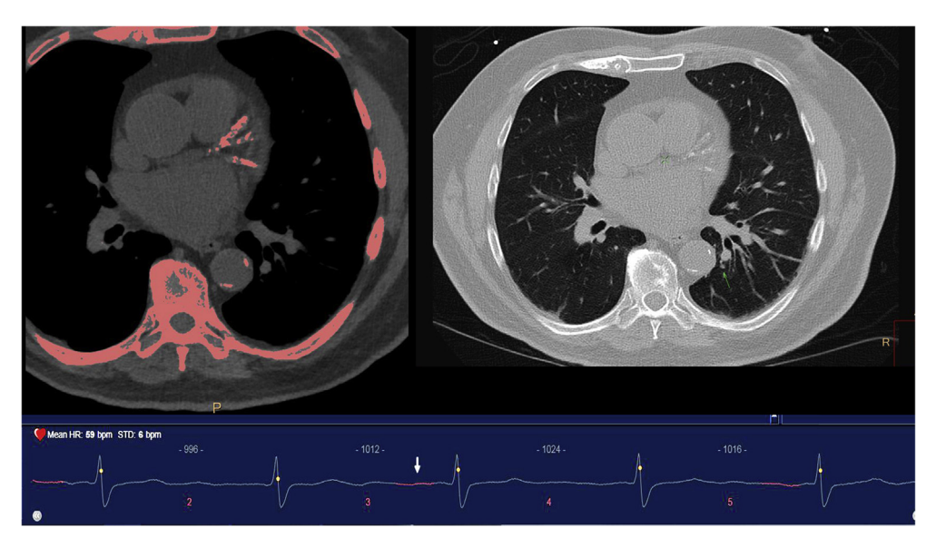
Fig. 2. American College of Radiology National Radiology Data Registry- Lung Cancer Screening Registry (ACR NRDR-LCSR).

and Protocols in 2010, which later was renamed "Alliance for Quality Computed Tomography Working Group". The task for this group was to develop a set of consensus reference CT protocols for common CT indications for each of the CT manufacturer's models to aid sites performing CT in creating and maintaining reasonable and appropriate CT protocols for specified indications. The acquisition parameters for these various combinations of scans and make/models are detailed on the AAPM Alliance for Quality Computed Tomography Working Group web page and are updated periodically and hence are not repeated here. Nonetheless, the following require emphasis: