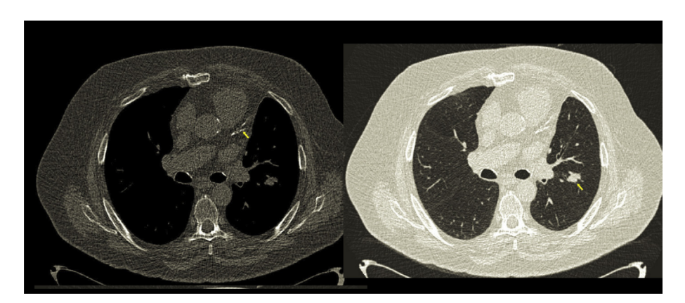
Fig. 3. Combined gated heart and lung scan. A 65 year old asymptomatic male smoker with 40 pack year history and hyperlidemia underwent combined scanning. Images were prospectively acquired in a step and shoot mode on a 256 slice scanner at 120kV and 25 mAs, with 3 mm slice thickness and radiation exposure of 0.95 mSv. Left: Calcium scan demonstrating extensive calcified coronary plaque in the left coronary artery (pink). The total Agatston calcium score was 1467. Riight: Lung window reconstruction reveals a 3mm left lower lobe nodule (green arrow) Bottom: EKG gating signal (yellow dot on R wave). Reprinted with permission of Oxford University Press from Hecht HS, Henschke CI, Yankelevitz D, Fuster V, Narula J. Combined Detection of Coronary Artery Disease and Lung Cancer. Eur Heart J 2014: 35:2792–6.

All technologists, physicists and supervising and interpreting physicians involved in the operation of a CT practice must meet minimum requirements for accreditation. The physician interpreting NCCT examinations should be certified by the American Board of Radiology, and must have document interpretation and reporting of 300 CT examinations in the past 3 years.<sup>53</sup> Alternatively, the physician must have completed a certified residency program and have interpreted 500 CT examinations in three years. For low dose CT (LDCT) screening examinations the interpreting radiologist should have supervised and interpreted at least 300